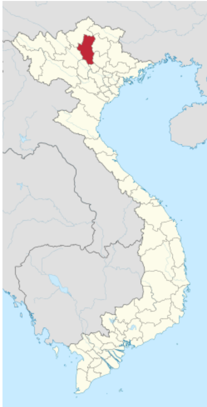
Map 1: Location of Tuyên Quang province in Vietnam